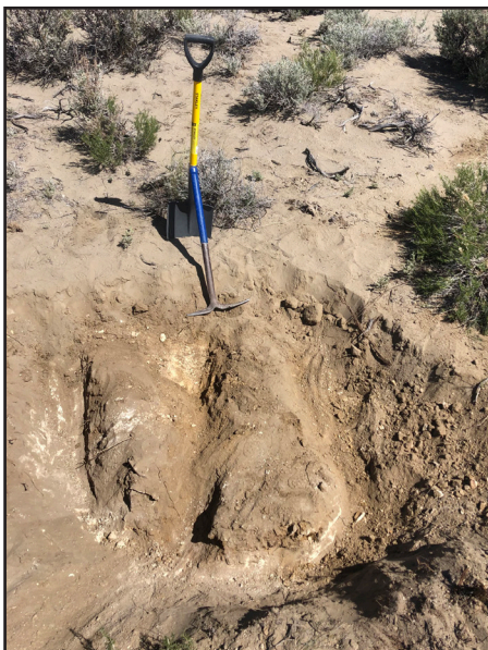
Unearthing two logs at the Blue Forest dig site, southwestern Wyoming.

Some specimens are a foot underground, and others can be four feet down. After you think you have found a piece, you can commence to digging. Shovels and picks come in handy. It is hard work, but can be well worth it. A lot of the time, when you start to unearth a log, it will seem way bigger than it ends up being due to a hard crust that is often surrounding the wood. After a lot of hard work and dirt moving, you will uncover your prize. Sometimes it ends up being an under-formed dud, but oftentimes, the end result is quite amazing. I recommend checking out the Blue Forest Collection site at some point in your life.