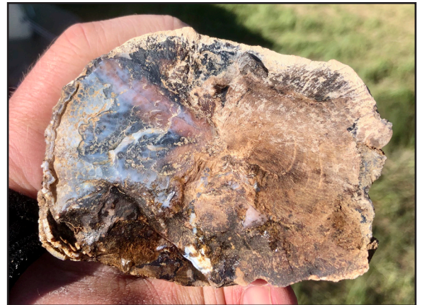
A nice chunk of petrified wood from the Blue Forest area of Wyoming, after I cleaned it up back at camp.

The Blue Forest petrified wood collection site has been around for many many years as evidenced by the abundant holes you will encounter. Finding the wood specimens can be