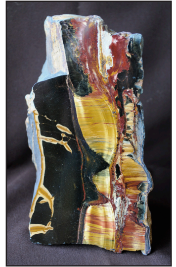
Asbestos specimen mixed with other metamorphic minerals. Western Australia. From the collection of Paul Syltie.

Asbestos was commonly used in various products, including insulation materials, roofing shingles, floor tiles, and automotive parts (like brakes). Naturally occurring asbestos can be found in various locations throughout the world including the United States, Russia, Kazakhstan, and Russia.